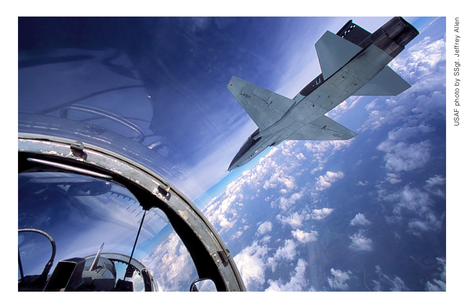
T-38s from the 12th Flying Training Wing at Randolph AFB, Tex., fly in formation. One of AETC's five flying training wings, the 12th FTW conducts T-38 Instructor Pilot training, graduating about 350 IPs each year.