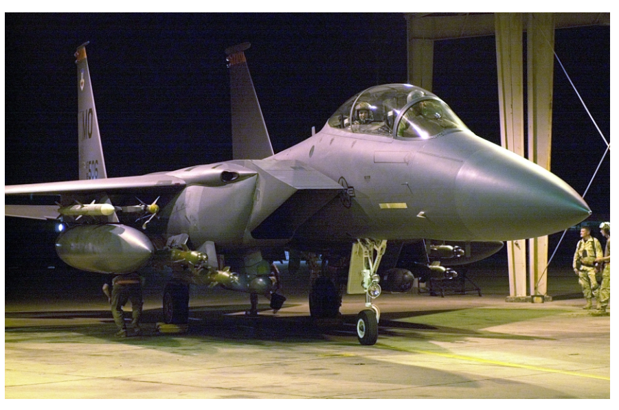
An F-15E Strike Eagle with the 366th Air Expeditionary Wing returns from a bombing mission in Afghanistan. The aircraft is based at Mountain Home AFB, Idaho.